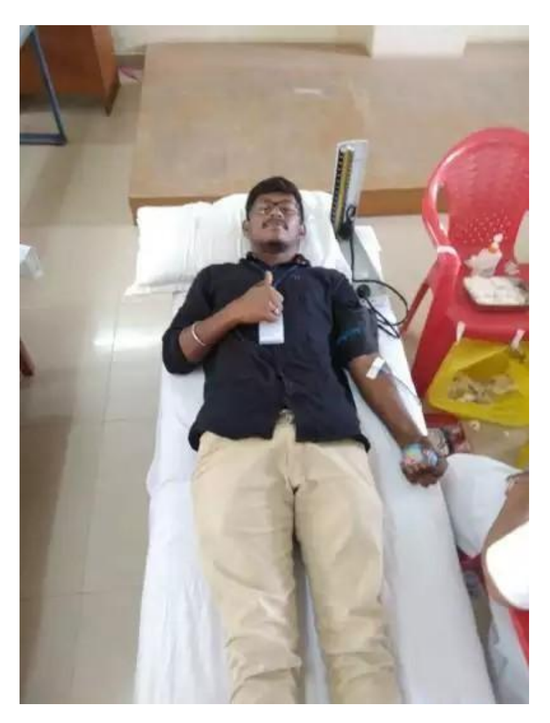
"Be a hero—donate blood and give the gift of life!