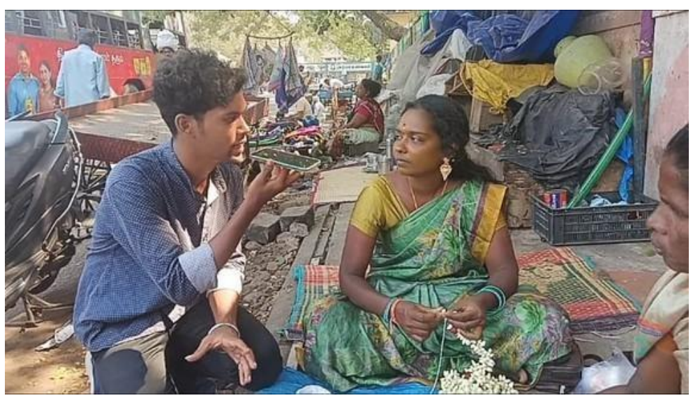
"Pathway to support People"