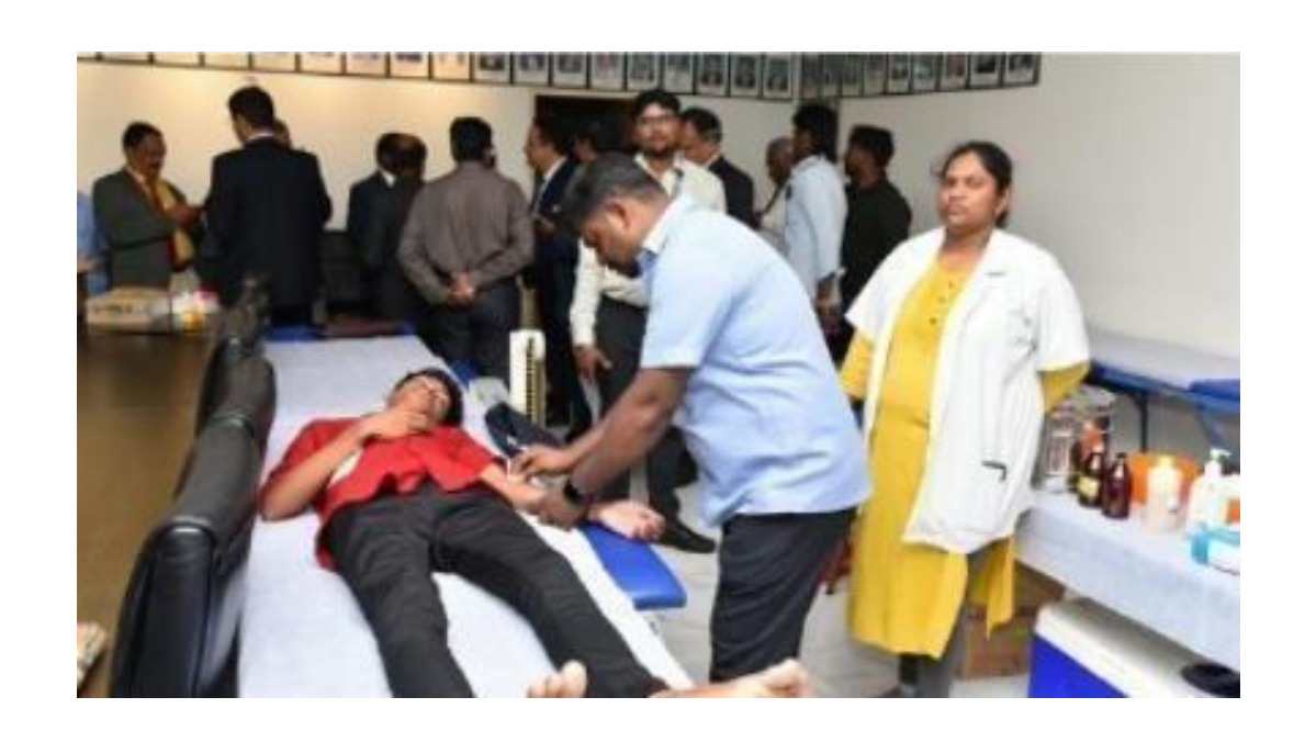
Blood Donation Drive