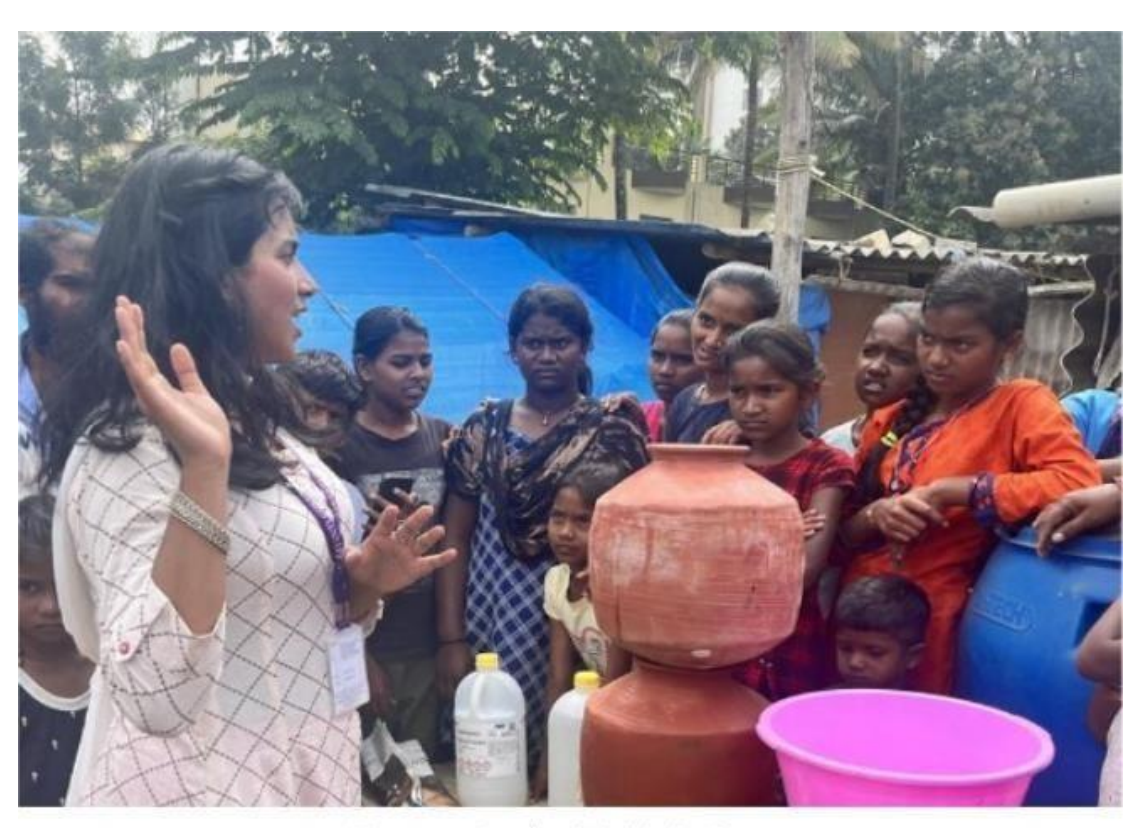
"Clean water, clean hands, healthy lives!"