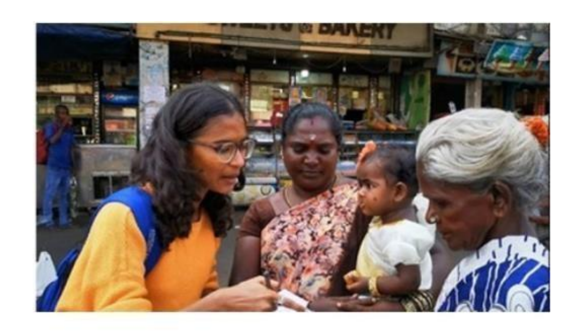
"Every act of kindness counts!"