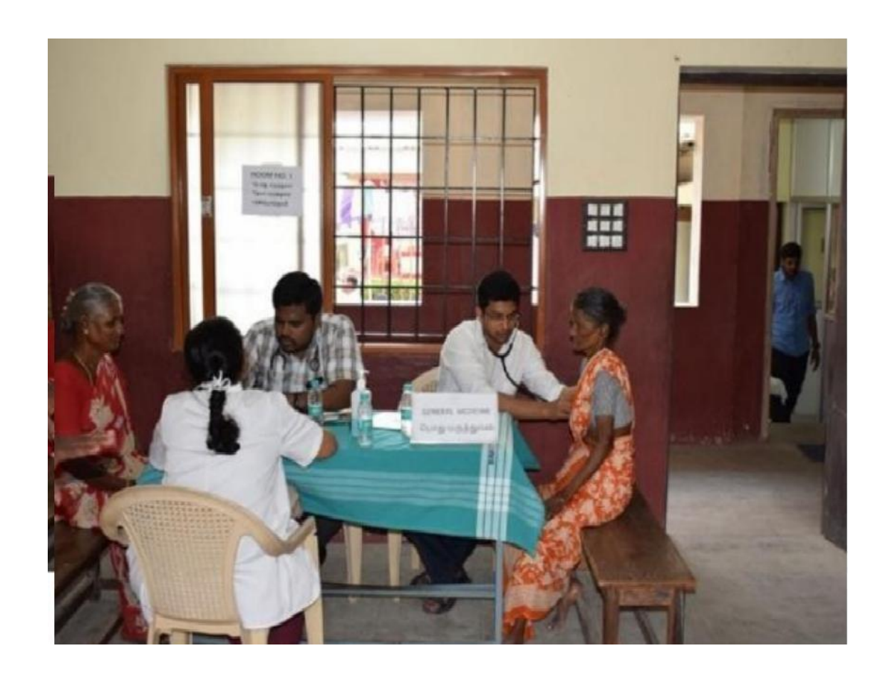
Prioritizing health at every age: Essential checkups for our beloves seniors