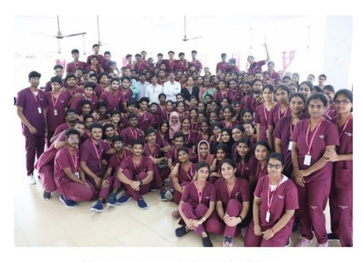
Disease Awareness Campaign for Future Physicians