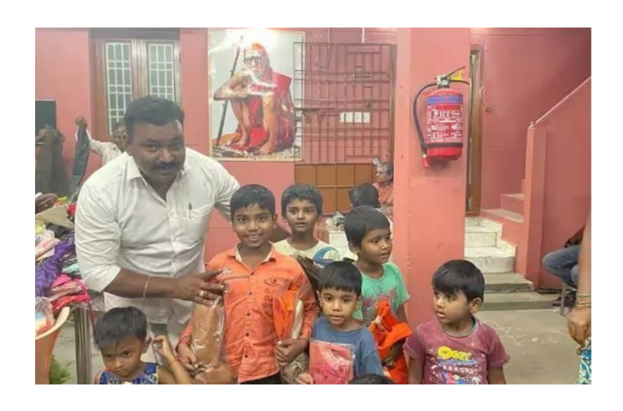
STREET AID INITIATIVE: SERVING THOSE IN NEED AT SAIDAPET