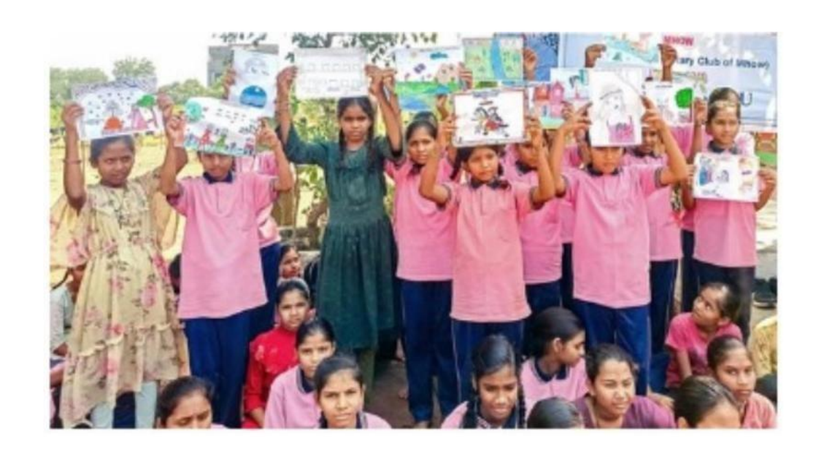
Umiting through culture to uplift lives "Together we can make a difference for those in need"